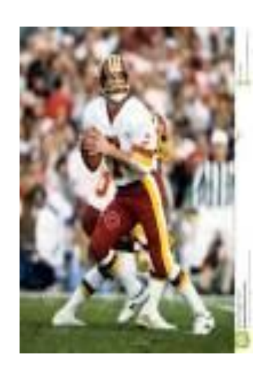
Joe Theisman Quarterback, Washington Redskins

"People say I'll be drafted in the first round, maybe even higher."