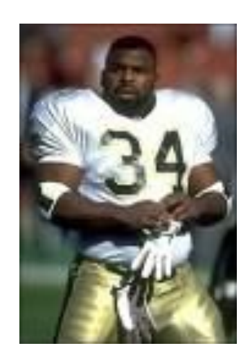
Craig "Ironhead" Heyward Running Back, New Orleans Saints

"People say I'll be drafted in the first round, maybe even higher."